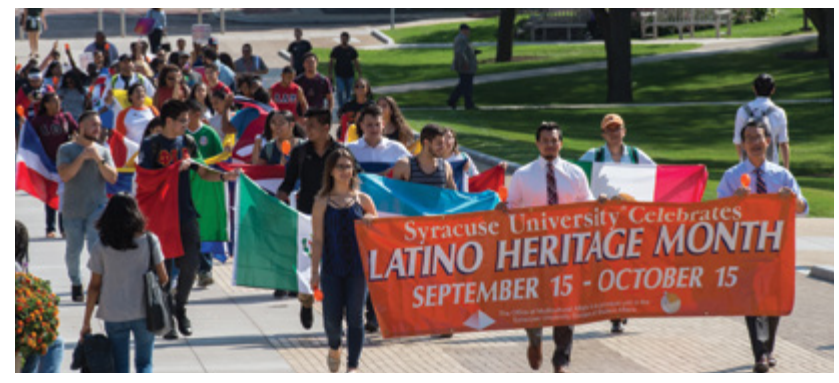
Latino/Hispanic Heritage parade