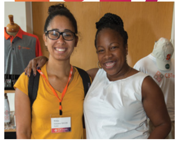
Arriticipants in the CBT Celebrity Classic