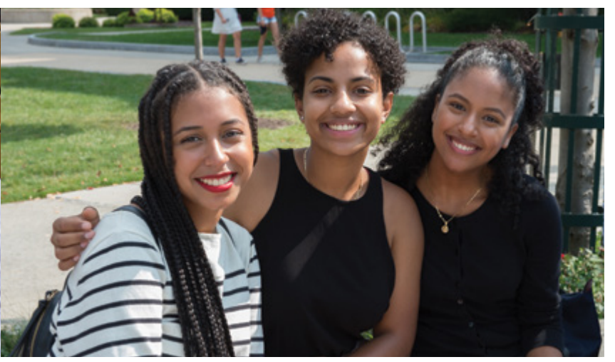
Students at the Orange Grove during CBT