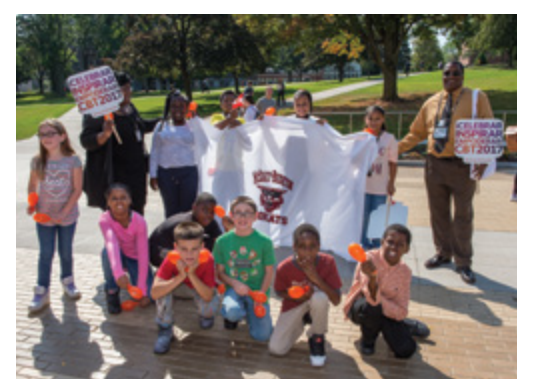
Students from McKinley- Brighton Elementary School who participated in the parade

The Office of Program Development partnered with Syracuse University's Office of Multicultural Affairs to host Latino/Hispanic Heritage Month (LHHM) from September 15 to October 15. The 12th annual program featured musical performances, traditional cuisine samplings, dance parties, and speakers, providing the campus and local community with many opportunities to learn about and experience the richness of Latino American cultures.